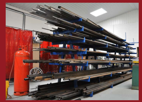
Why not combine your trip with a tour of our factory to learn a little more about how we make our carriages?

Bennington has the largest selection of British made carriages and an extensive range of quality carriage driving accessories on display in our new, purpose built showroom.